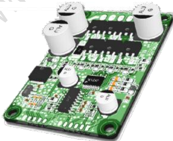
Driver Board Diagram